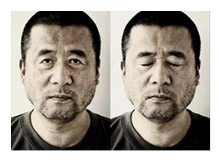
B. 1957 in Hangzhou, China. Education: BA obtained from the Oil Painting Department, Zhejiang Academy of Fine Arts, Hangzhou