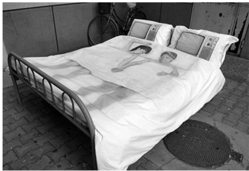
Video installation by CHEN Ran