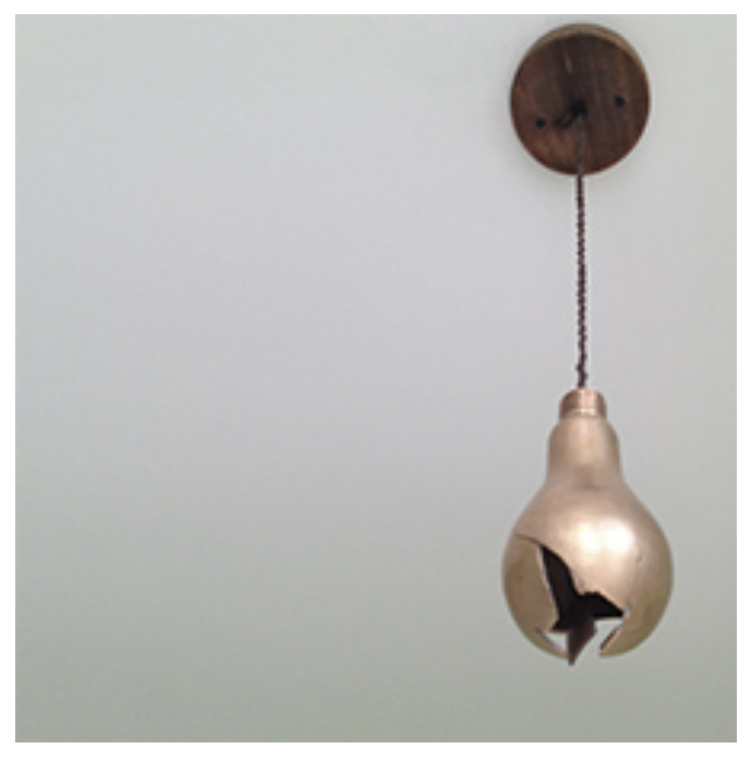
Installation voice of the light by WEN Fang